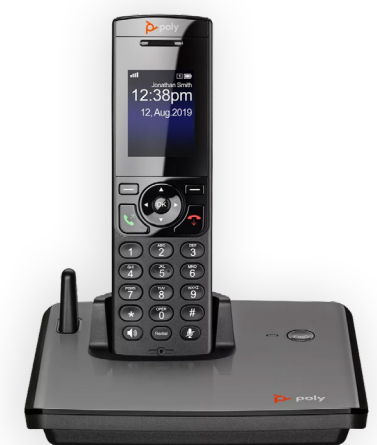
Poly VVX D230