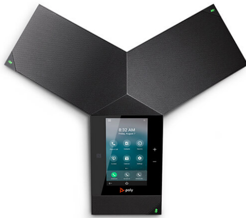
Poly Trio 8300 Conference Phone