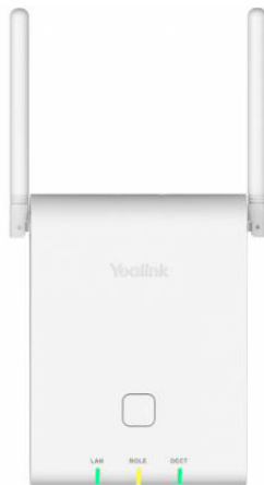
DECT IP Multi-Cell Base Station W90B