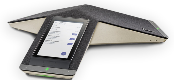
Poly Trio C60