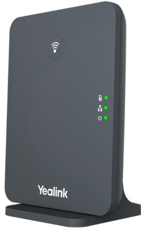
Yealink DECT IP Base Station W70B