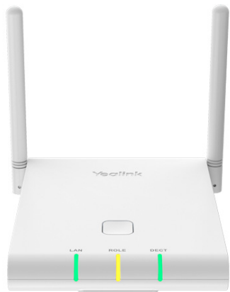
DECT IP Multi-Cell Base Station W90DM